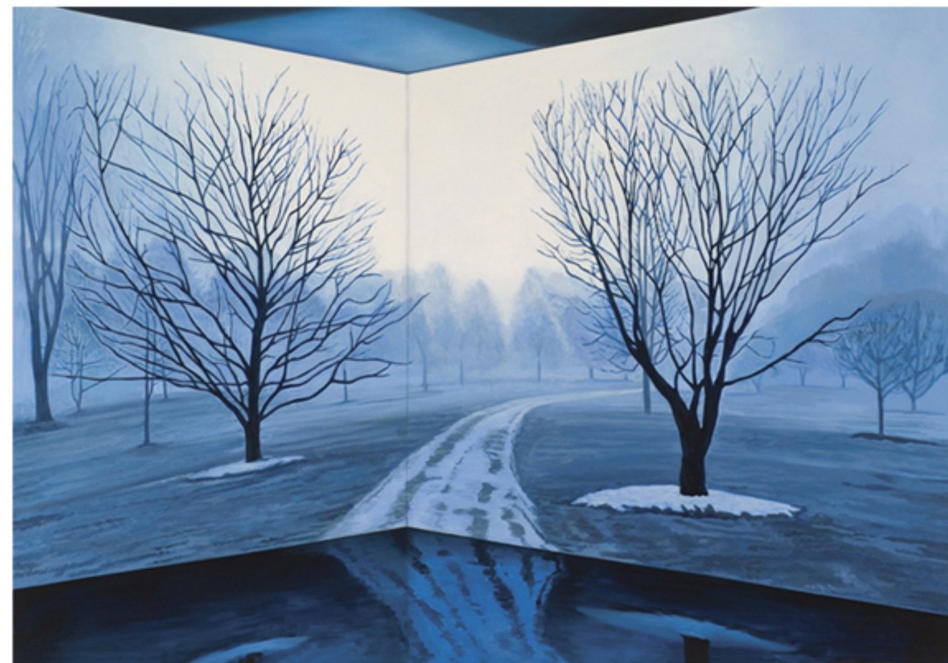
SEAM, OIL ON LINEN, 50 X 72"