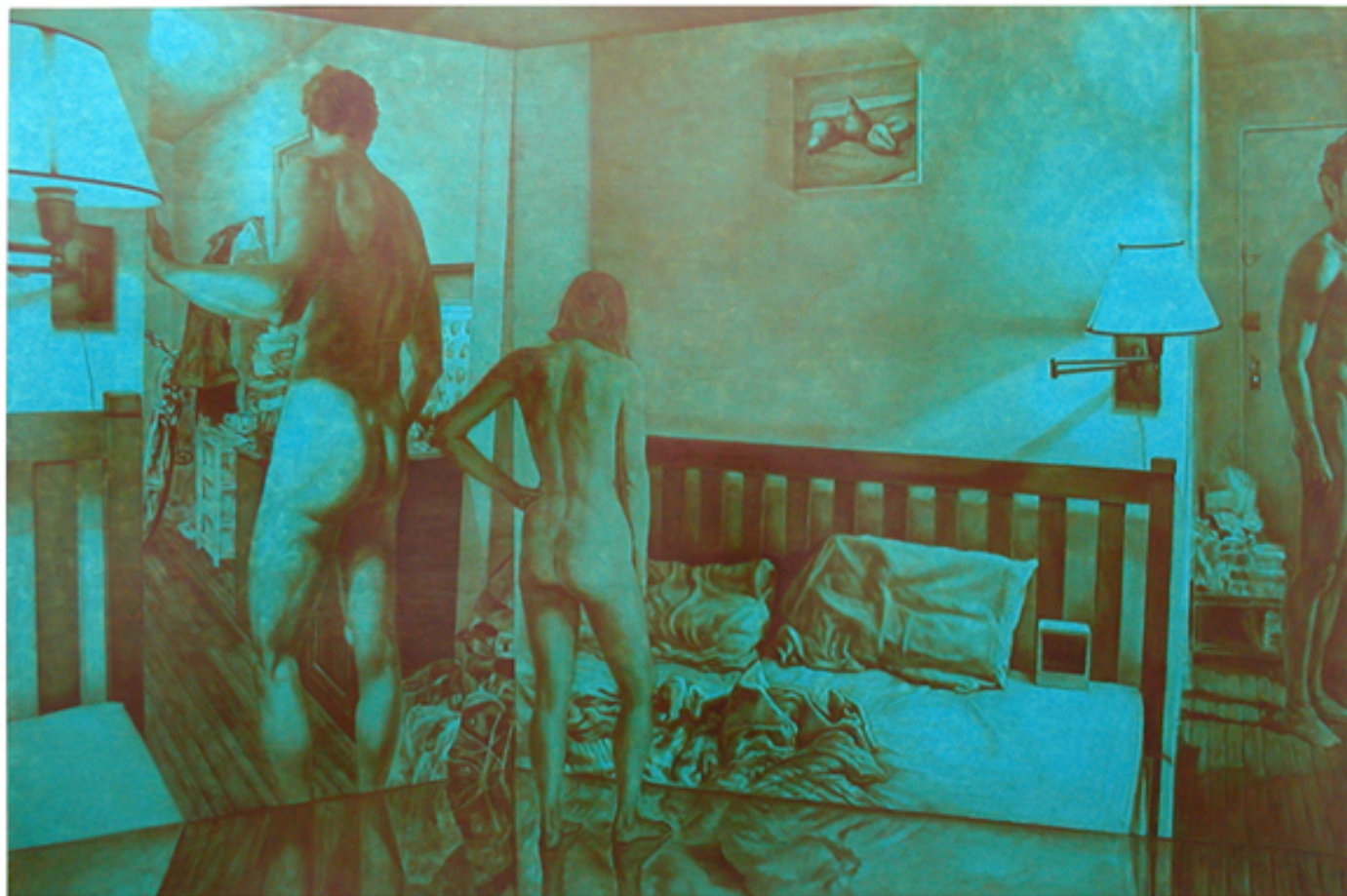
BLUE ROOM, OIL ON LINEN, 48 X 72"