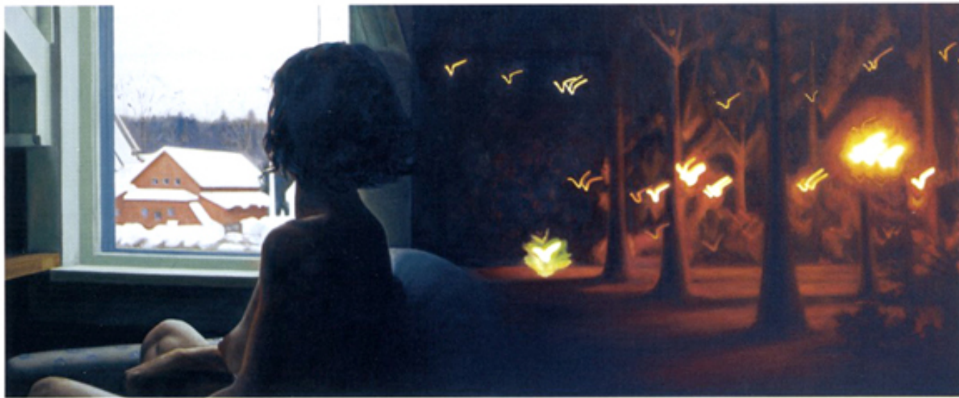
FLIGHT, OIL ON LINEN, 20 X 40"